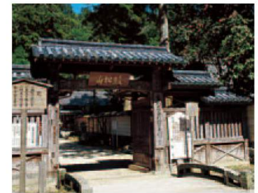
The Shiromineji Temple