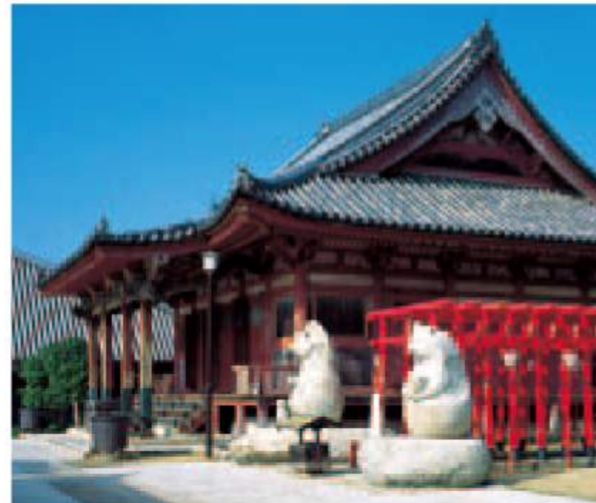
The Yashimaji Temple