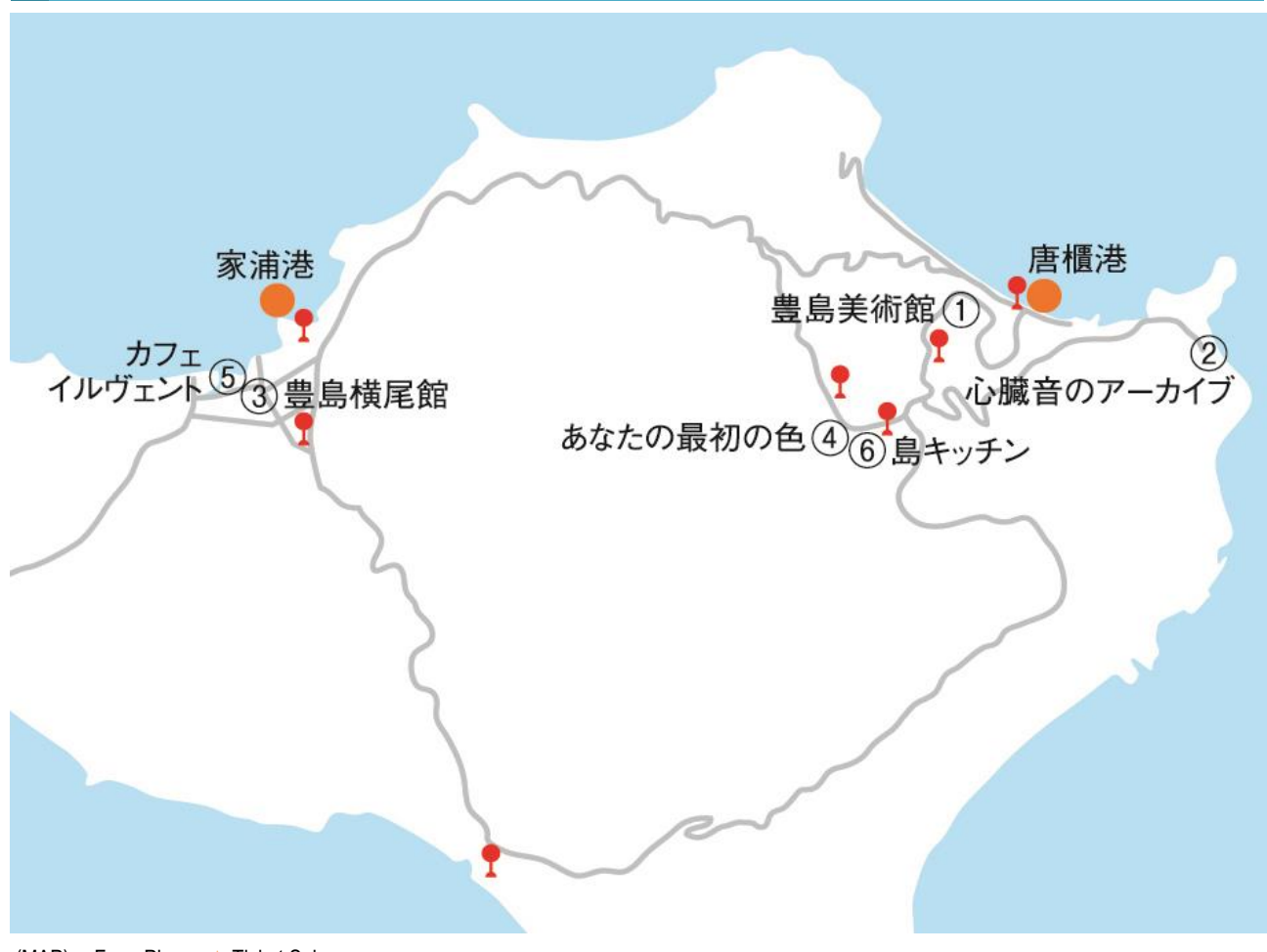
(MAP) • Ferry Pier 🛛 🖈 Ticket Sales