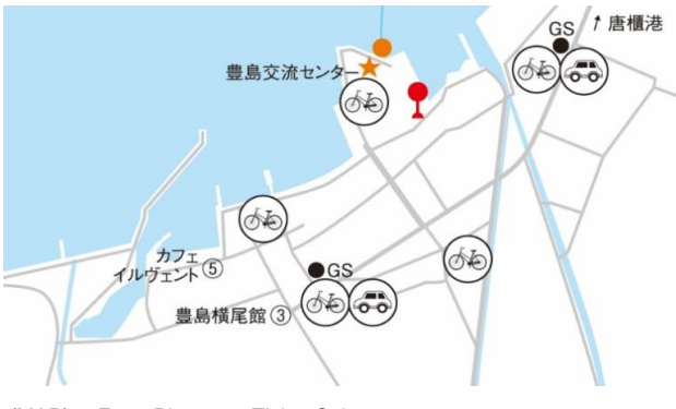
(MAP) • Ferry Pier 🛛 🛧 Ticket Sales

See Teshima Tourism Association Website for information on fares and opening hours http://www.teshima-web.jp/access/post-22/